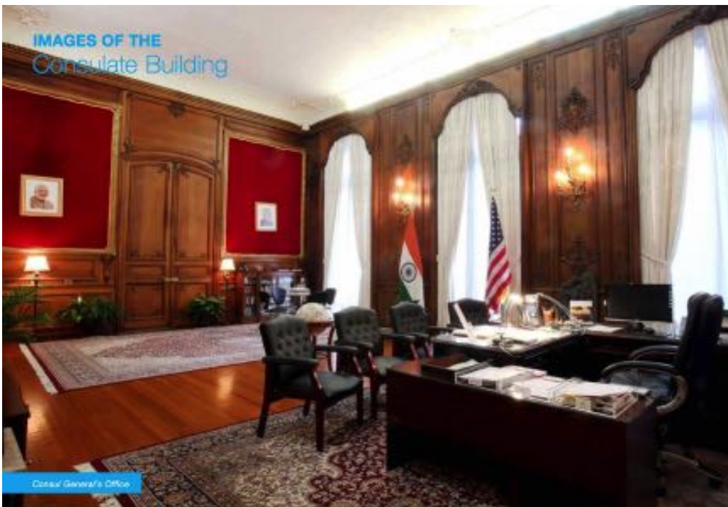
Consul General's Office